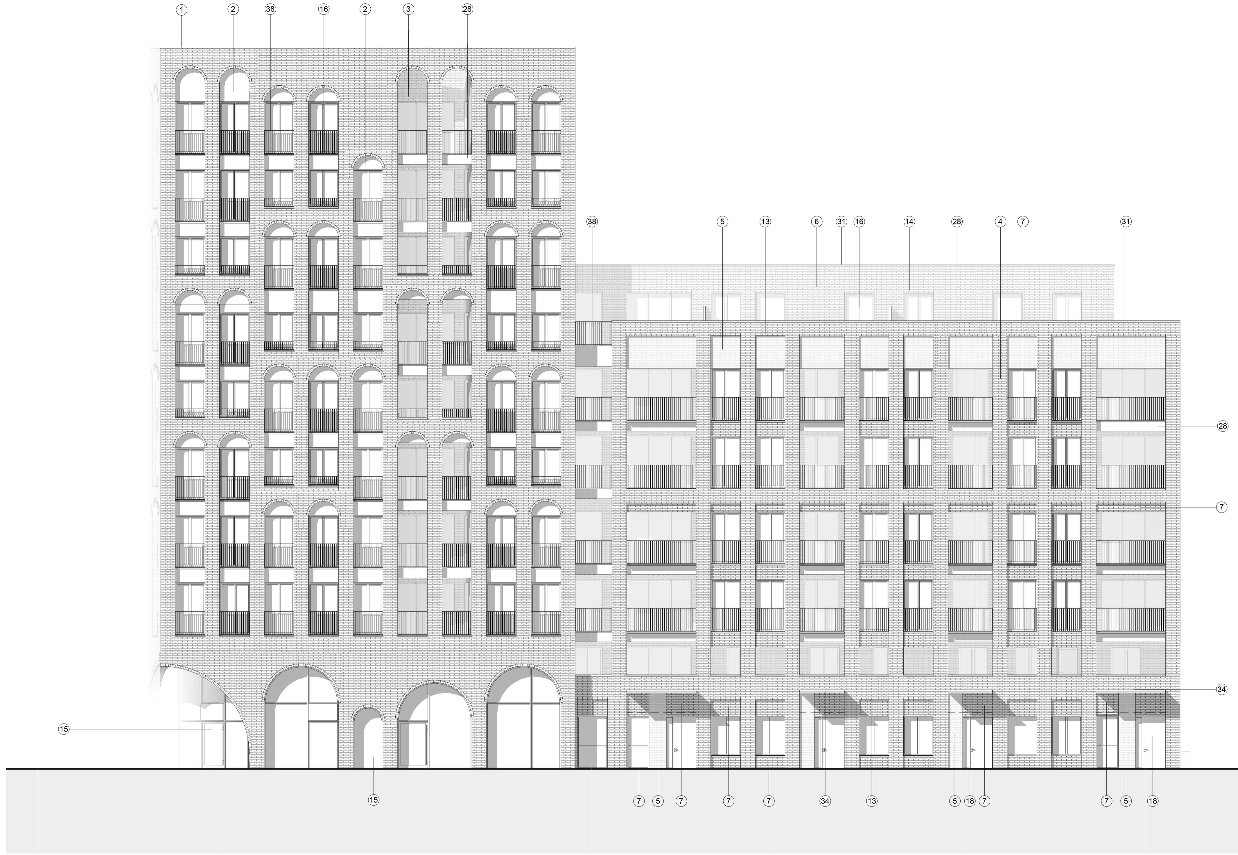
Block A & B South Elevation 1 : 100